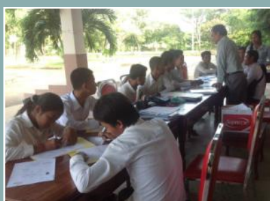
Enrolment day—2012. For these students university was once an unobtainable dream.

In Bakong the same thing is happening. We now have 15 additional role models carving out a path for their younger siblings to follow. These are 15 young people who are now a big step closer